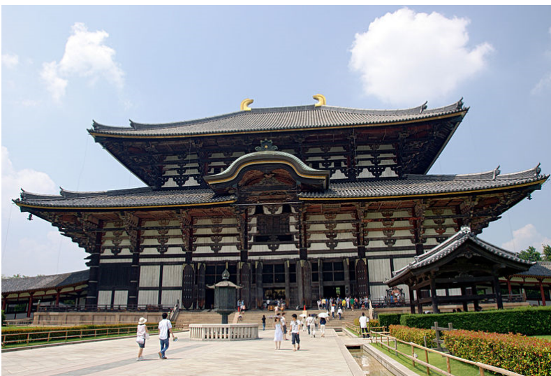
Tōdai-ji's Golden Hall is a Japan's National Treasure, in Nara, Japan

An international conference on optical, optoelectronic and photonic materials for a wide range of applications from telecommunications to photovoltaics; and optical, optoelectronic and electro-optic properties of all classes of materials and material systems.