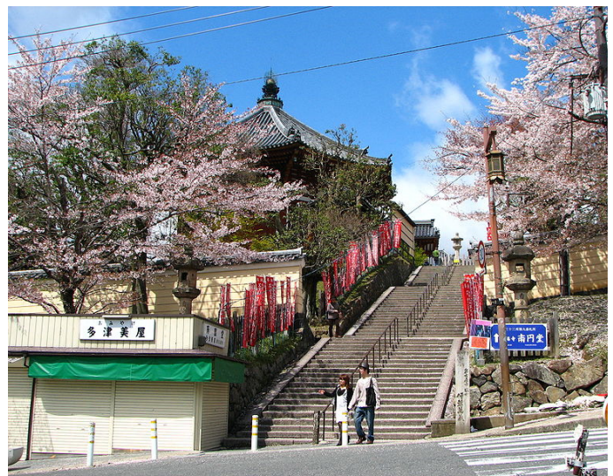
Entrance of to Kofukuji Temple, Nara Prefecture, Japan